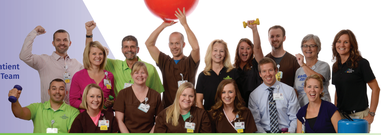
DCH's Outpatient Rehab Team